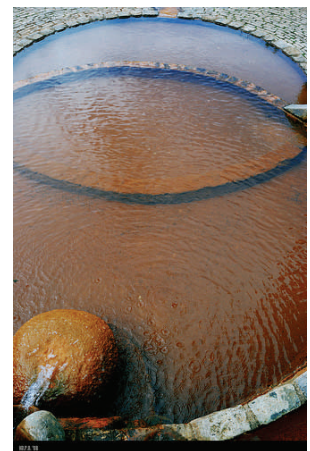
Vesica Piscis in the Chalice Well